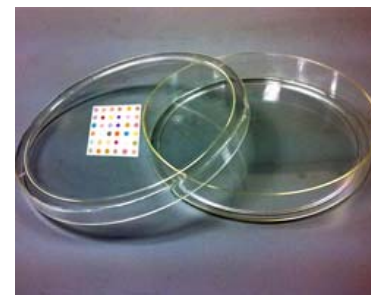
A colorimetric sensor array is placed in a Petri dish for culturing bacteria and scanned with an ordinary flatbed photo scanner kept inside a lab incubator. The dots change color as they react with gases the bacteria produce.

"The progression of the pattern change is part of the diagnosis of which bacteria it is," Suslick said. "It's like time-lapse photography. You're not looking just at a single frame; you're looking at the motion of the frames over time."