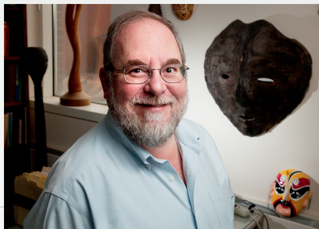
Ken Suslick led a team of Illinois chemists who developed an ultrasonic hammer to help explore how impact generates hotspots that trigger explosive materials.

The Illinois researchers used the ultrasonic hammer to bombard the material with ultrasound waves, watching with a fast infrared camera to detect any hot spots. They saw that the ultrasound triggered local hot spots and tiny explosions within the material, without destroying the material completely.